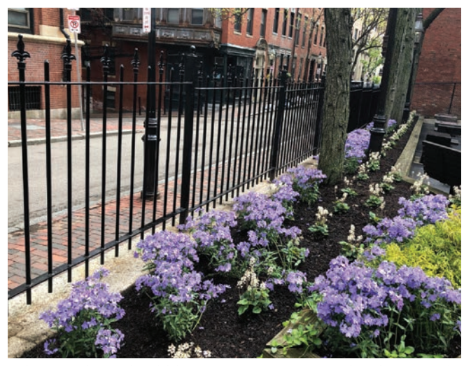
This new fence should last many years, giving the playground a beautiful edge along the street.