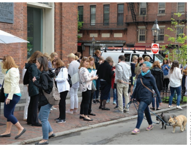
Hosted 2,000 ticket holders at the day-long 2019 Tour of the Hidden Gardens of Beacon Hill in May. In this photo the crowds gather to obtain booklets that will guide them through the 10 gardens open on that day.