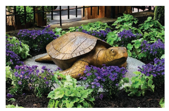
Installed a bronze Myrtle the Turtle, crafted by sculptor Nancy Schön, in the Myrtle Street Playground amid newly planted annuals and native perennials.